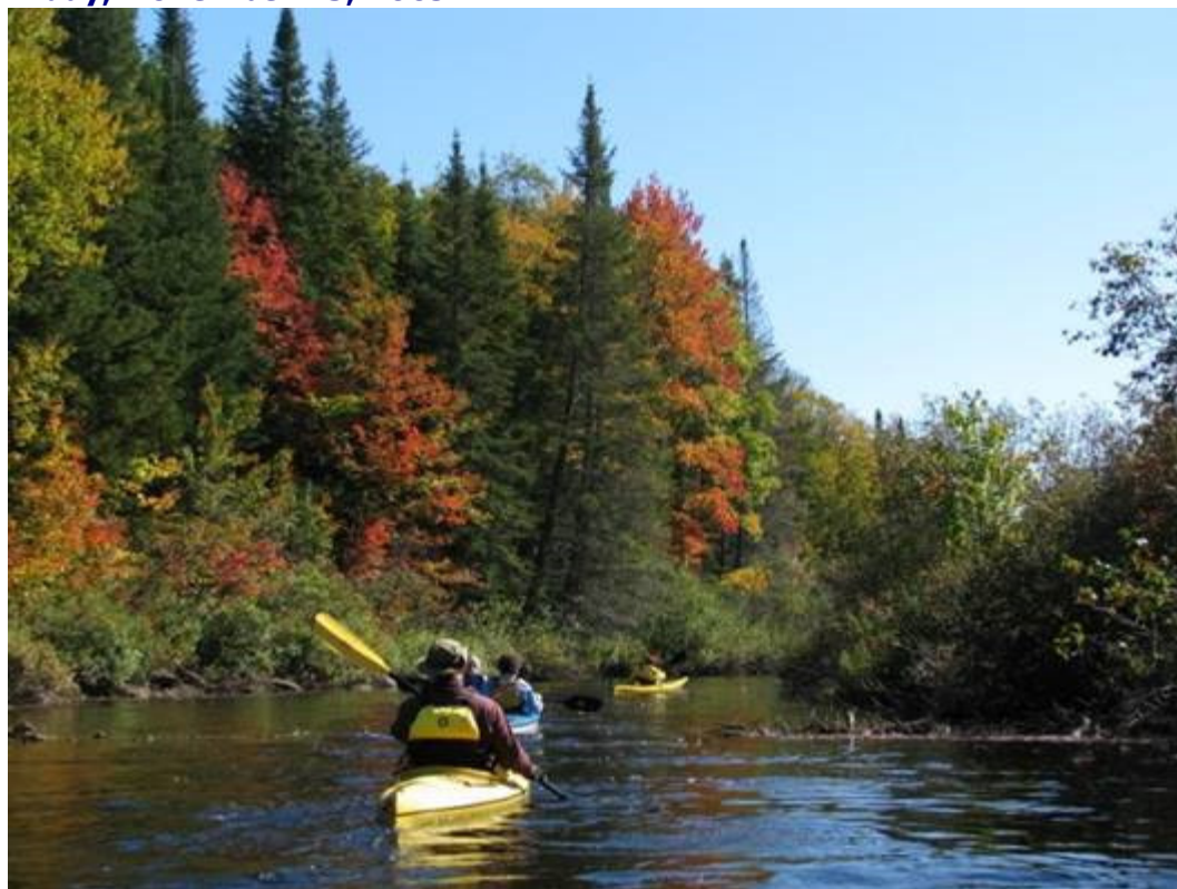
Near the Adirondacks