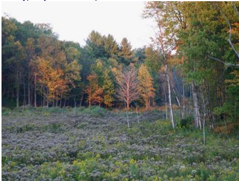
Fall in Syracuse, NY