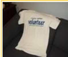
R.A.P.E. Center volunteers

Buffalo Peace Bridge POE, New York; Cape Vincent POE, New York; Champlain POE, New York; Chateaugay POE, New York; Fort Covington POE, New York; Heart Island POE, New York; John F. Kennedy International Airport (JFK), New York; Lewiston Bridge POE, New York; Mooers POE, New York; Niagara Falls, Rainbow Bridge, New York; Newark International Airport (NEW), New Jersey; Ogdensburg POE, New York; Rochester-Ferry Terminal, New York; Rouses Point POE, New York; Seaway International Bridge/Massena POE, New York; Thousand Islands POE, New York; Trout River POE, New York