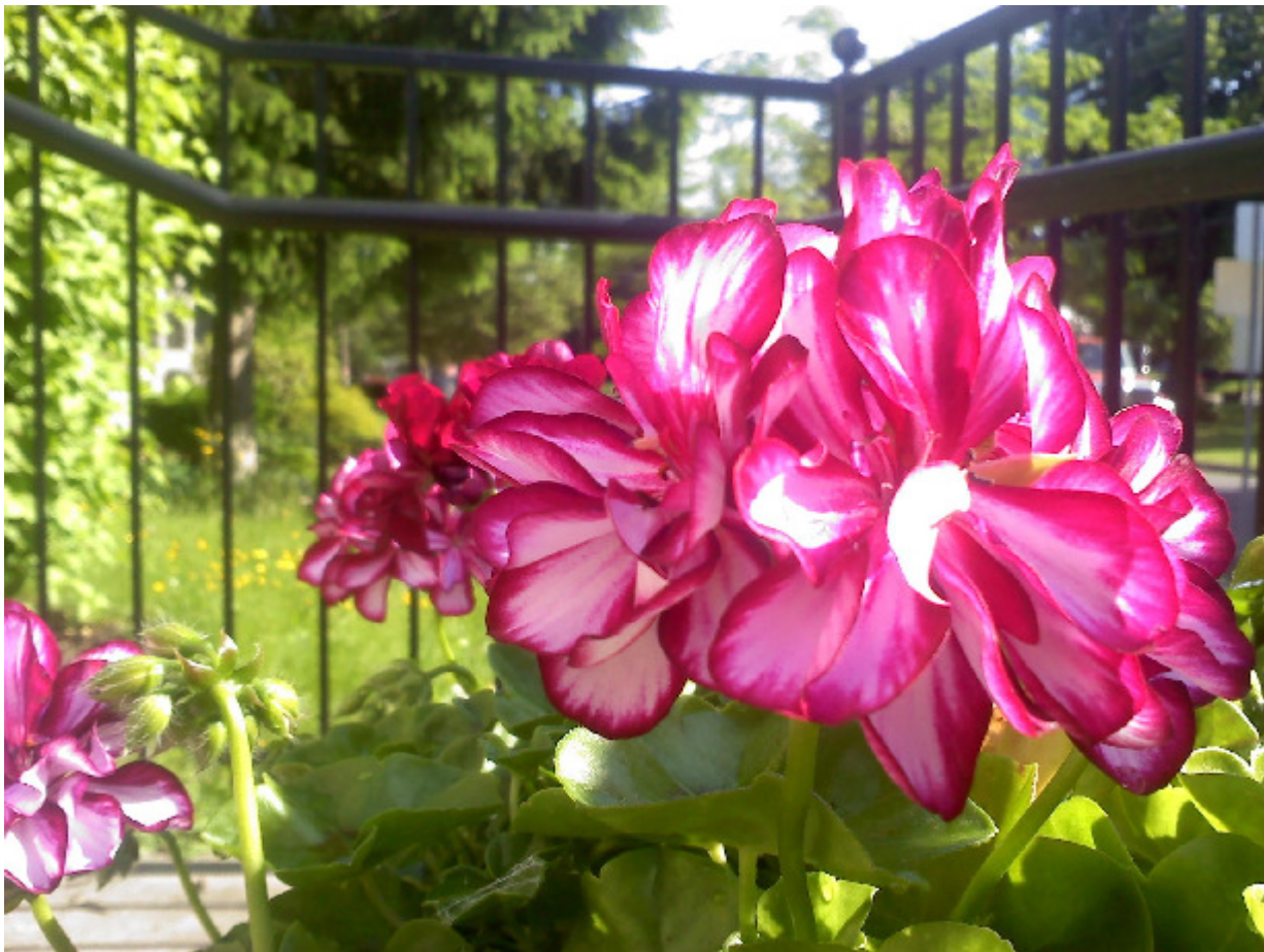
Flowers from the Slutzker Center Garden.