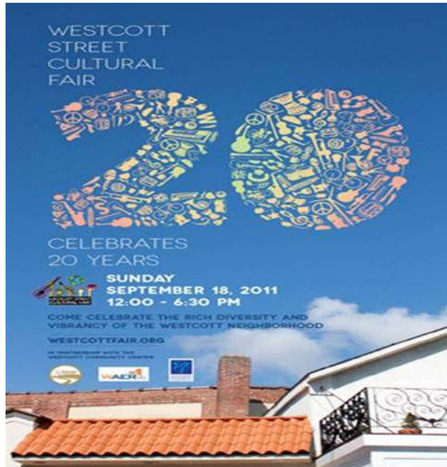
20th Annual Westcott Street Cultural Fair Sunday, September 18, 2011 www.westcottfair.org

The Westcott Street Cultural Fair (WSCF) is an annual, one-day celebration of the diversity and uniqueness of the Westcott neighborhood through its culture: visual and performing arts, food, service organizations and activities geared to families and Syracuse and LeMoyne students returning to the neighborhood. The fair attracts more than 8,000 people annually to the Westcott Business District in mid-September for a day filled with great sounds, sights, tastes and more.