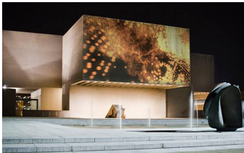
Urban Video Project